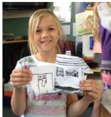
Takahe enjoyed making Three D Houses during their latest Stem Challenge!